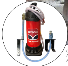
Optional: Dust suppression kit, Item no. 1113286 HYCON Water Container, Item no. 3030051

Contact us for more information: hycon@hycon.dk / +45 96 47 52 00