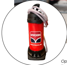
Optional Dust suppression kit Item no. 3030051

Contact us for more information: hycon@hycon.dk / +45 96 47 52 00